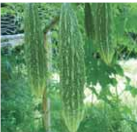
Bitter Gourd - BG61811

Maturity (days) : 55-60 Fruit Length (cm) : 28-30 Fruit Diameter (cm) : 6-6.5 Fruit Weight (g) : 500-600 Color : Light green Remark : Long-slender shape