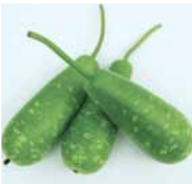
Bottle Gourd - BO4802

Maturity (days) : 55-60 Fruit Length (cm) : 28-30 Fruit Diameter (cm) : 5.5-6 Fruit Weight (g) : 350-500 Color : Grey-green color