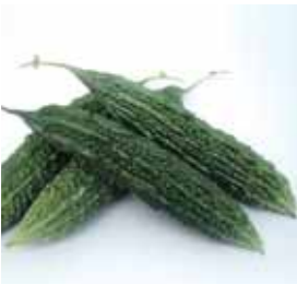
Bitter Gourd - BG4710

QUALITY SEED IS LION SEEDS www.lionseeds.com