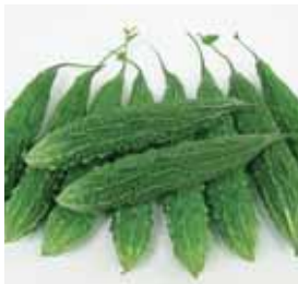
Bitter Gourd - BG4718

Maturity (days) : 60-65 Fruit Length (cm) : 25-28 Fruit Diameter (cm) : 5.5-6 Fruit Weight (g) : 300-400 Color : Glossy dark green Remark : Attractive shiny curly skin