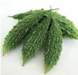
Bitter Gourd - BG4714

Maturity (days) : 65-70 Fruit Length (cm) : 30 Fruit Diameter (cm) : 7 Fruit Weight (g) : 600-700 Color : Glossy dark green Remark : Attractive curd skin