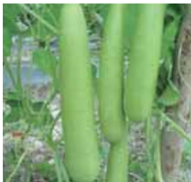
Bottle Gourd - BO5702

Maturity (days) : 55-60 Color : Light Green Fruit Weight (g) : 1200-1500 Fruit Length (cm) : 50-55 Remark : Very vigorous vines and many branches, high yield