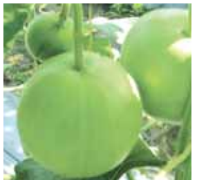
Bottle Gourd - BO5703

Maturity (days) : 55-60 Color : Light Green Fruit Weight (g) : 1000-1500 Fruit Length (cm) : 50-55 Remark : High yield