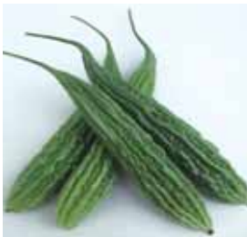
Bitter Gourd - BG4717

Maturity (days) : 60-65 Fruit Length (cm) : 25-28 Fruit Diameter (cm) : 5.5 Fruit Weight (g) : 300-400 Color : Dark green Remark : Attractive shiny curd skin, thick, tender flesh and medium bitter taste