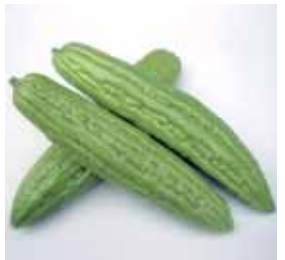
Bitter Gourd - BG4713

Maturity (days) : 60-65 Fruit Length (cm) : 25-28 Fruit Diameter (cm) : 5-5.5 Fruit Weight (g) : 300-400 Color : Glossy dark green Remark : Attractive shiny curly skin, high yield, attractive fruit