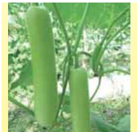
Bottle Gourd - BO5701

Maturity (days) : 70-75 Color : Green rind with white spots Fruit Weight (g) : 1500-2000 Fruit Length (cm) : 30-34 Remark : Very vigorous vines and many branches, high yield